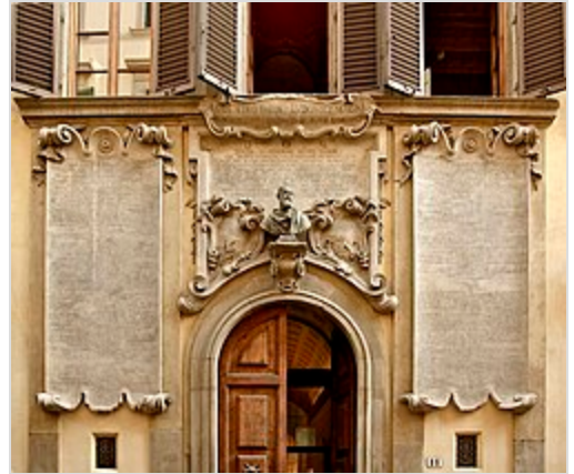
The "Palazzo Viviani" or "Palazzo dei Cartelloni" with plaques and bust dedicated by Viviani to Galilei